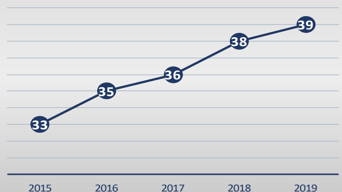
Average Months from Removal to Adoption SFY2015 - SFY2019